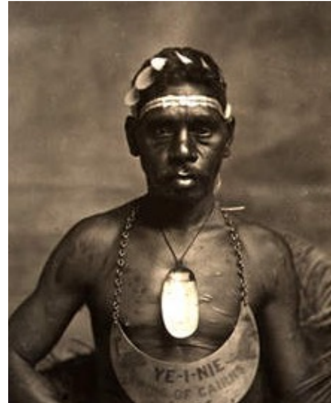
"Ye-i-nie/King of Cairns/1905".