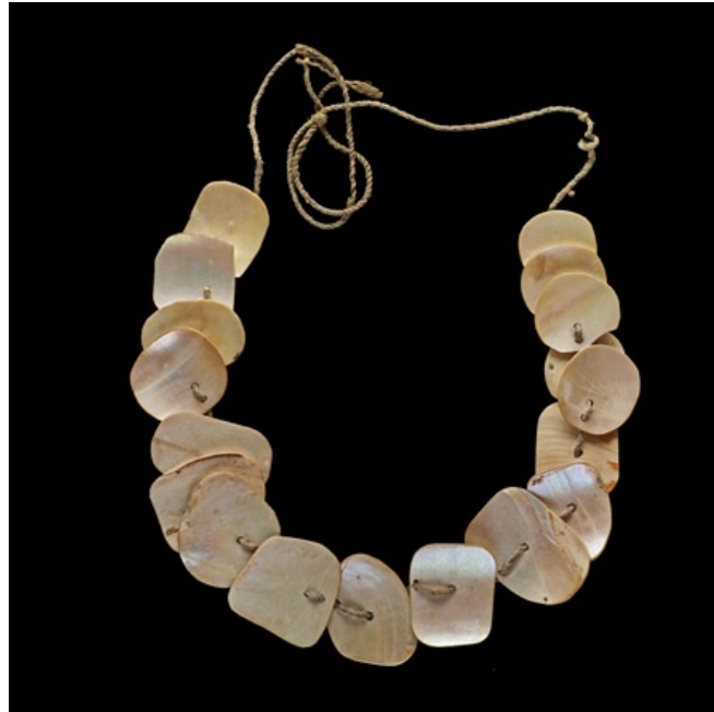
Nautilus shell necklace, Yidinji people, collected from the Cairns region before 1903. British Museum.

"The (shell) ornaments are believed to have magical presence. They are like diamonds or gold. It gives status and energy."